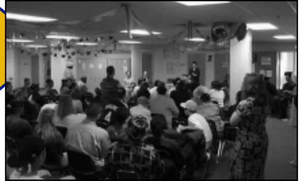
The Bay Cove community celebrates graduation

He spoke of graduation as a journey which includes the obvious academic pressures but also issues that deal with ques-